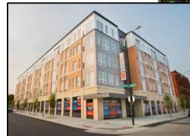
BGSU and Cedar

Point continue to be good neighbors to Sandusky. Our hometown now has the only resort & attraction management degree embedded in a theme part. Their academic facility is a new build on E. Market St.